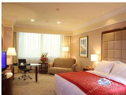
Type 1: King Bed